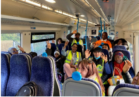
Diversity House travel training

Over 90% of participants said they felt more confident to travel by rail as they had learnt how to buy a ticket, find the correct platform and knew how to obtain assistance, etc.