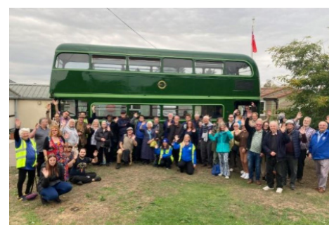
History and Heritage Day Isle of Sheppey

This year over 100 people were taken on train travel training trips (TTTT) to build their confidence, knowledge and skills to travel by rail and for some to progress onto travelling independently. Many of these trips were funded by The Motability Trust administered by Community Rail Network. Some TTTTs include additional skill developments e.g. a gardening project at a station, a walk on the North Downs Way or a visit to a café to practice ordering refreshments and essential social skills. TTTTs also build group cohesion and friendships with opportunities to chat with other service users and staff in a supportive and more informal setting than the classroom. These trips were provided to students at Five Acre Wood (FAW Maidstone and Snodland schools), Grow 19 College, Ashford College, Heath Farm School, Bromley Mencap, Diversity House and Sittingbourne Cubs. Some students receiving the TTTTs were from Somalia, Uganda, Afghanistan, Syria, Ethiopia, Brazil, Congo, Kazakhstan, Nepal and Iran.