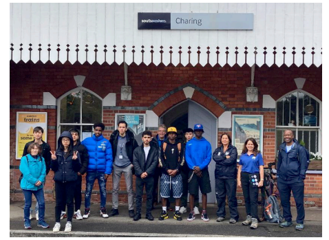
Ashford College ESOL students – Charing to Lenham