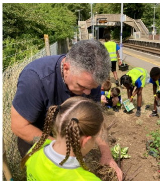
Milton Court Primary School at Kemsley

The Partnership works tirelessly to recruit and retain a substantial number of dedicated volunteers from a variety of sources within its communities. The Partnership provides a welcoming and inclusive environment where all are appreciated. The Hollingbourne Station CIC and its volunteers were awarded our coveted 'Volunteer of the Year' award for their incredible success in managing the Hollingbourne project and Signal Box Café. The hugely energetic team are dedicated to providing much needed amenities for their community via its refurbished station, helping to reduce isolation and loneliness.