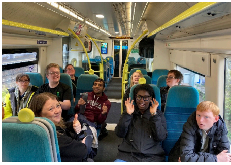
Grow 19 College travel training