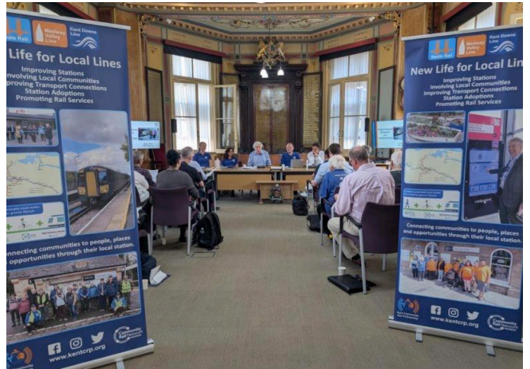
Kent CRP Annual Public Stakeholder meeting

The Annual Stakeholder meeting provides an opportunity for the impact of these projects and activities to be celebrated and shared.