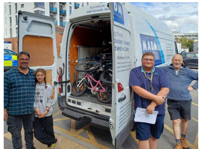
Recycling cycles Maidstone West station

Our events have directly supported and invested over £7,500 in local artists, garden centres and venues this year with many more thousands indirectly invested by attendees.