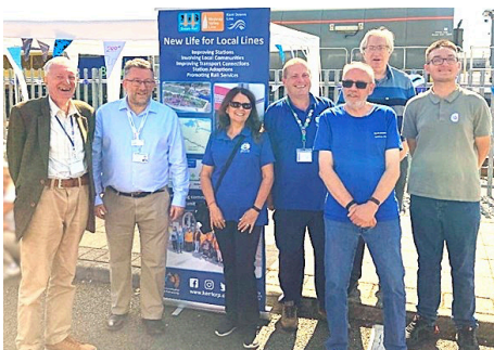
Ashford Depot pop up

Over 90% of participants said they felt more confident to travel by rail as they had learnt how to buy a ticket, find the correct platform and knew how to obtain assistance, etc.