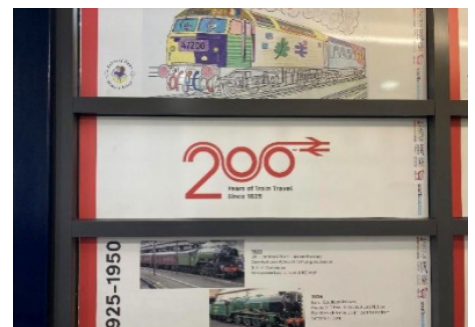
Three of 64 decals at Ashford International station