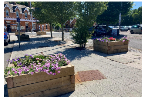
Grow 19's planters at West Malling