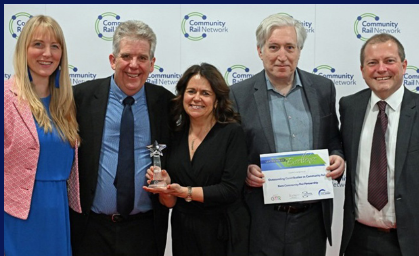
2025 Community Rail Network Award Winning Partnership

“Outstanding Contribution to Community Rail”