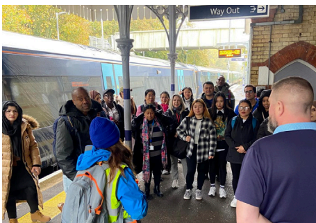
Ashford College travel training