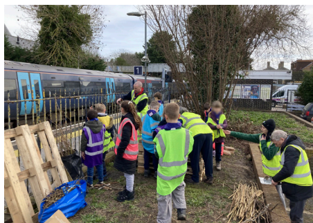
4th Milton Regis (St Marys) Cubs

"The trip was very well organised and provided a safe, supportive environment for participants to build confidence using public transport independently."