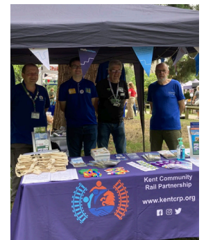
Maidstone River Festival pop up