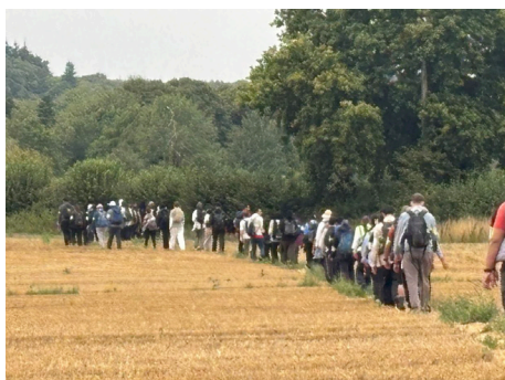
'Muslim Hikers' walking group mostly from London on North Downs Way

Officers support 20 station adoption groups working at 19 of its stations. Station adopters enhance the station environment for station users and improve the travel experience for passengers through projects they chose to deliver. This year we welcome our newest station adopters, Harrietsham History Society at Harrietsham station. Station adoption projects promote community cohesion by caring for public spaces, whilst addressing the needs of the community. Many of our station adoption students attend special educational needs and disabilities (SEND) schools and gain confidence whilst learning and speaking with passengers. They have been known to move on to careers in horticulture after taking part in station adoption projects. "I wish you were at our station" – Member of the public visiting Margate Inspiration Train.