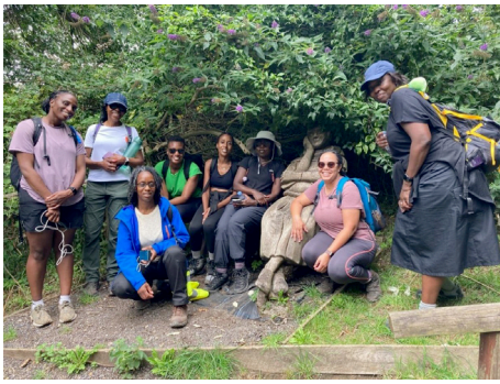
'Black Girls Hike' walking group from London – Charing to Hollingbourne