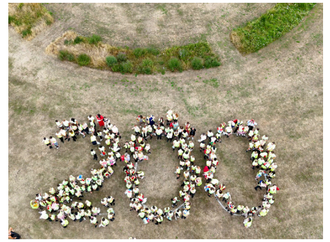
Queenborough Railway 200 Procession

90 copies of Arlo's Adventures issued to children, reinforcing the rail safety messaging delivered during the session.