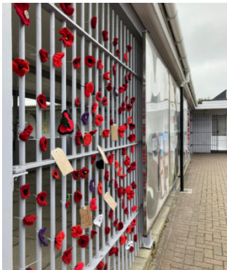
EKC College Poppies at Sheerness

EKC College and Valley Park Schools Remembrance Poppy Installations at Sheerness and Maidstone East stations - 4 weeks of public engagement across November.