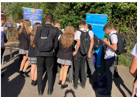
Lenham School's pop up at Lenham Station