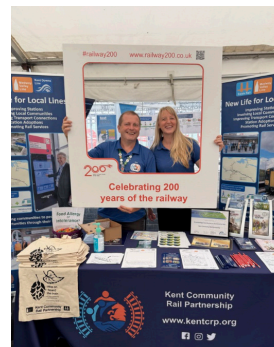
Inspiration Train, Margate pop up