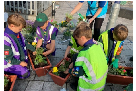
Cubs Scouts at Sittingbourne