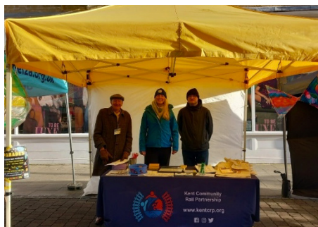
Sheerness Festival pop up

"I had some very interesting conversations with the public, which helped spread our community rail message."