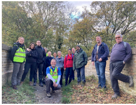
Exploring the new North Kent Woods and Downs National Nature Reserve from Cuxton Station