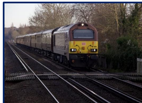
Class 67 at East Malling