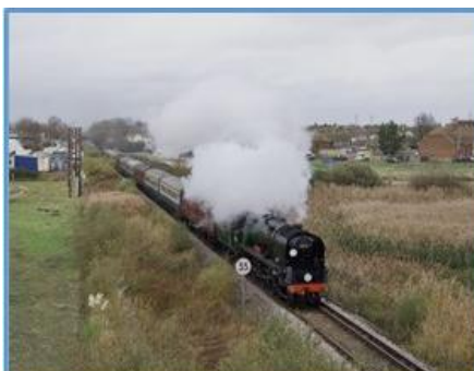
Armistice Belle