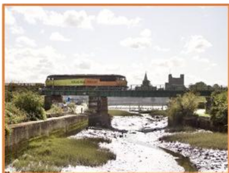
Class 56 crossing Jane's Creek