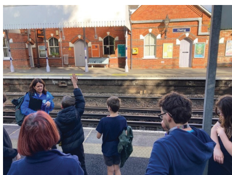
Heath Farm School 8 students