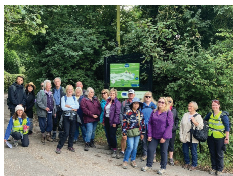
Lenham to Hollingbourne 21 walkers