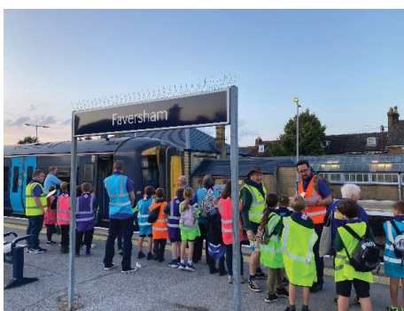
4th Milton Regis Cub Scouts 30 Cubs