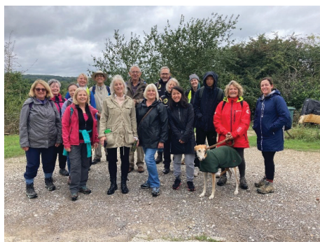
Wateringbury Hills 17 walkers