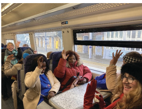
Diversity House 14 participants