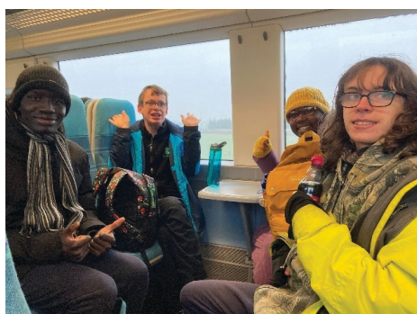
Grow 19 College 9 students