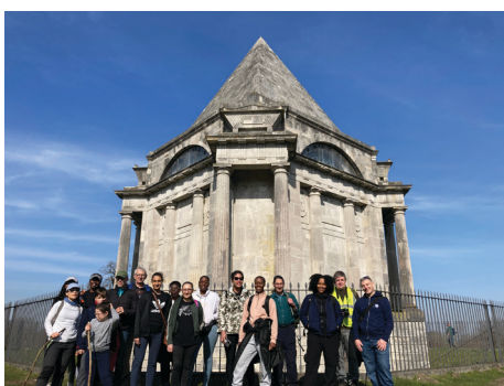
Cuxton 19 walkers