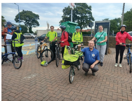
Bikes On Trains 7 cyclists