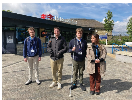
Ashford College 18 students