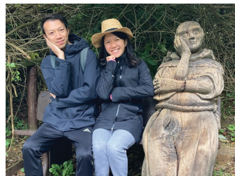
Charing to Harrietsham 35 walkers