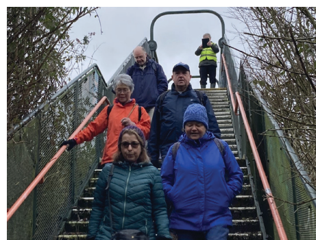
Paddock Wood Oasts 12 walkers