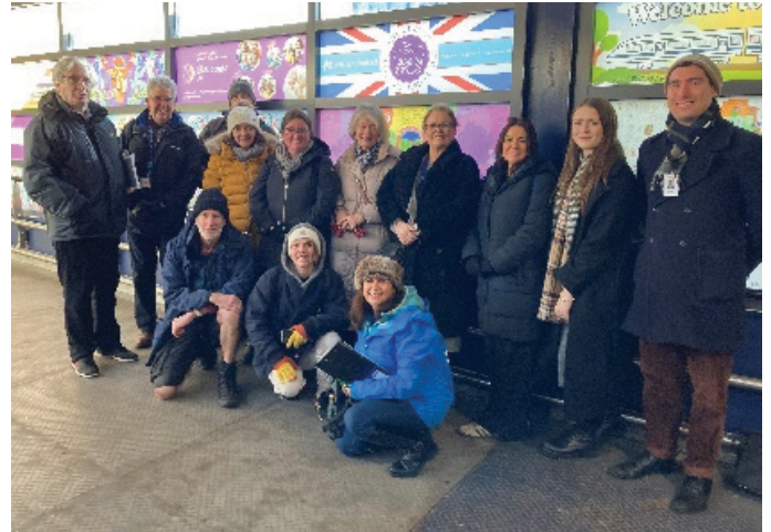
KDL January line meeting

Quarterly Steering Group and individual line meetings are held to update members and stakeholders on the progress of the action plan and offer further opportunity for community engagement.