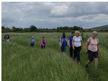
Snodland Lakes 12 walkers