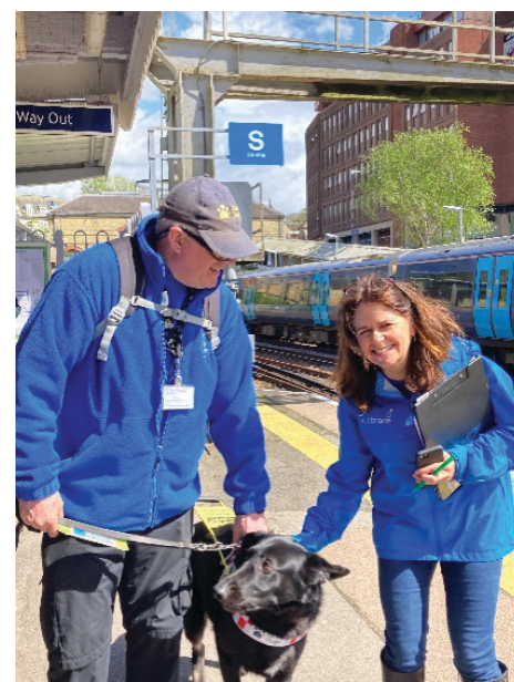
Paws on the Platform 14 participants