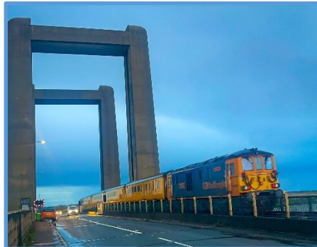
Test train on Kingsferry bridge