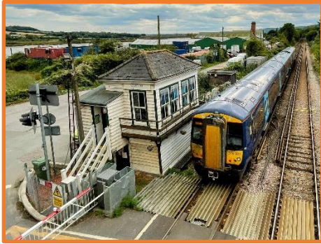
Cuxton Signal Box