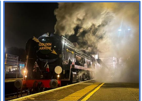
Golden Arrow Tour