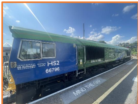
Green Progressor at Strood