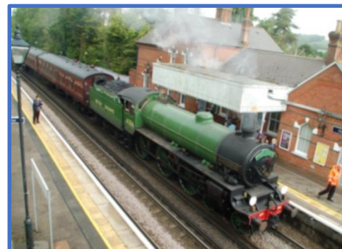
Mayflower at Charing