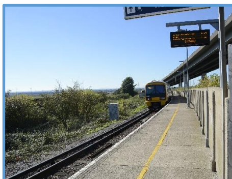
Swale Station Kent CRP