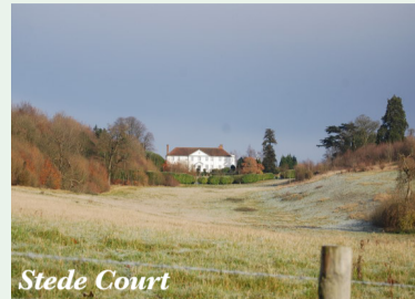
Stede Court

You may have noticed the unusual pattern of wooded areas in this landscape. Known as Grotto Wood this is thought to be part of the ornamental planting of the estate and has remained the same for at least 150 years.