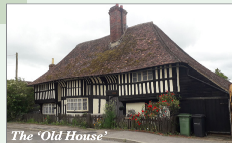
The 'Old House'