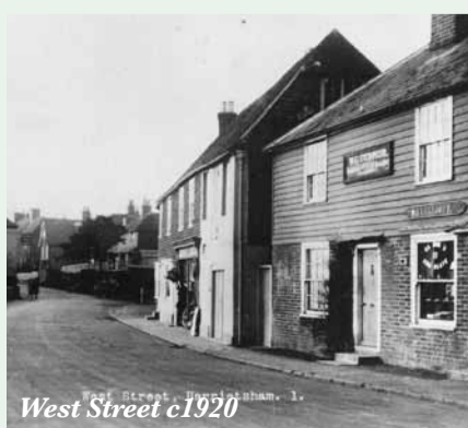
West Street c1920

There are nine listed buildings on West Street, some dating from the 16th and 17th centuries. The Roebuck Inn (the last surviving of four pubs in the village) has a 19th-century façade but a 15th- or 16th-century core. The post office is also notable – dating from the 18th century. (Please note most of the historic buildings are private residences, so please respect people's privacy.) As recently as the 20th century, West Street had a good range of shops, including a butcher, a wool shop, a sweet shop, Suttons General Stores, a newsagent, a clock maker, a baker, a saddler and a petrol station.