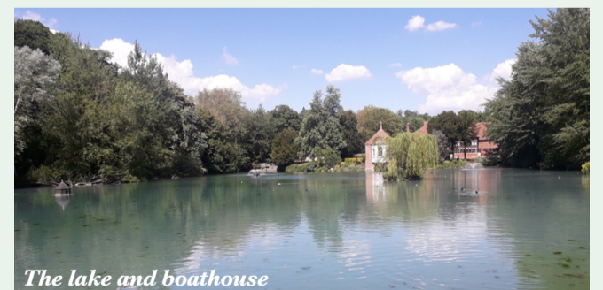
The lake and boathouse

This tranquil site is owned by Harrietsham Parish Council and used by local people for walking and relaxation. The main feature is a lake, which is home to a variety of aquatic birds, including mallards, coots, moorhens, greylag geese, mute swans and the more unusual little grebe. Most of these species probably nest here. The surrounding trees and shrubs provide habitat for other wildlife; the presence of trees and water makes it a good site for bats. Grass snakes can be seen on the banks and swimming in the water! There are fish in the lake but no fishing is allowed.