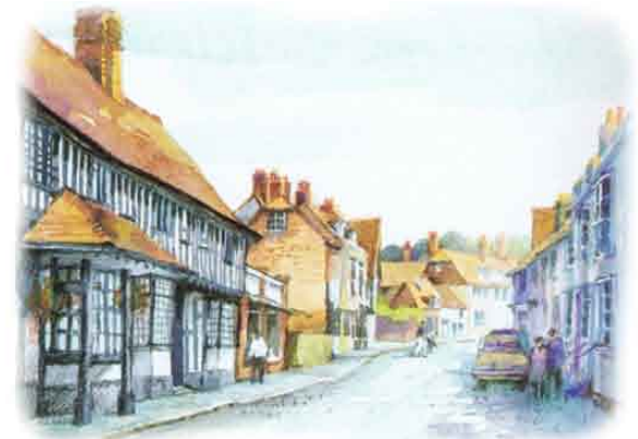
Charing High Street

Après avoir traversé le village historique de Charing, l'itinéraire de randonnée suit une partie du sentier des pèlerins ou Pilgrims' Way, avant de retourner à Charing par le sommet des downs et le bois dit Kite Hill Wood.