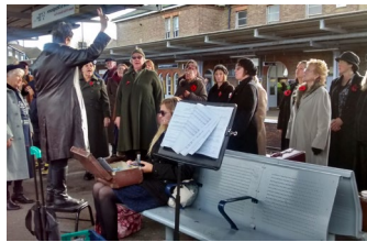
Sea Folk singing at Sittingbourne station (SRL)