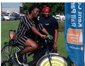
Isle of Sheppey smoothie bike pop-up