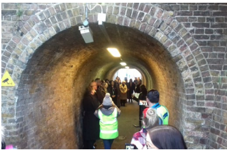
Sea Folk sing at Strood station (MVL line)