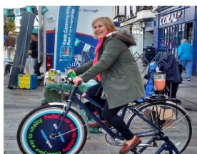
Maidstone CycleFest 2018