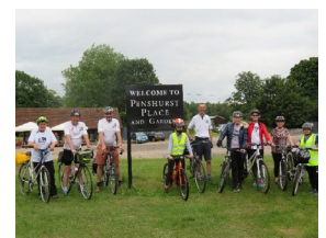
Family Bike Ride