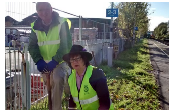
Rotary Club crocus bulb planting at Maidstone Barracks