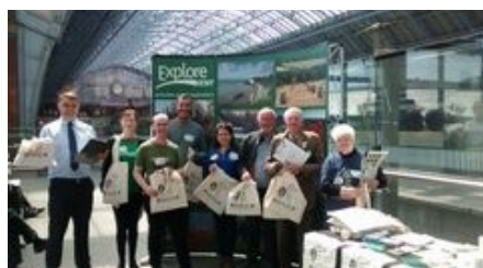
Community Rail in the city - St Pancras