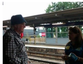
Rail safety week