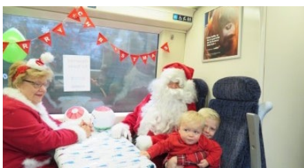
Santa on the Train event