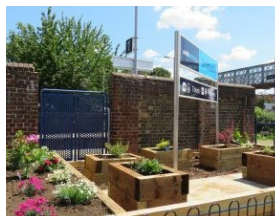
Five Acre Woods student garden