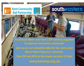
Pop-up Southern Water