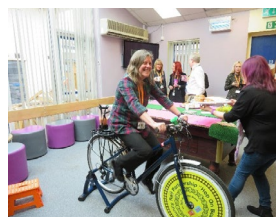
Pop-up Sheppey College