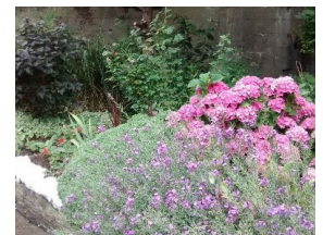
Maidstone West station garden