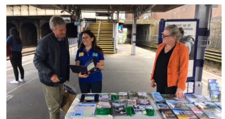
Tourism Pop-Up - Tonbridge