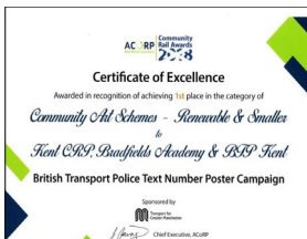
First place ACoRP award